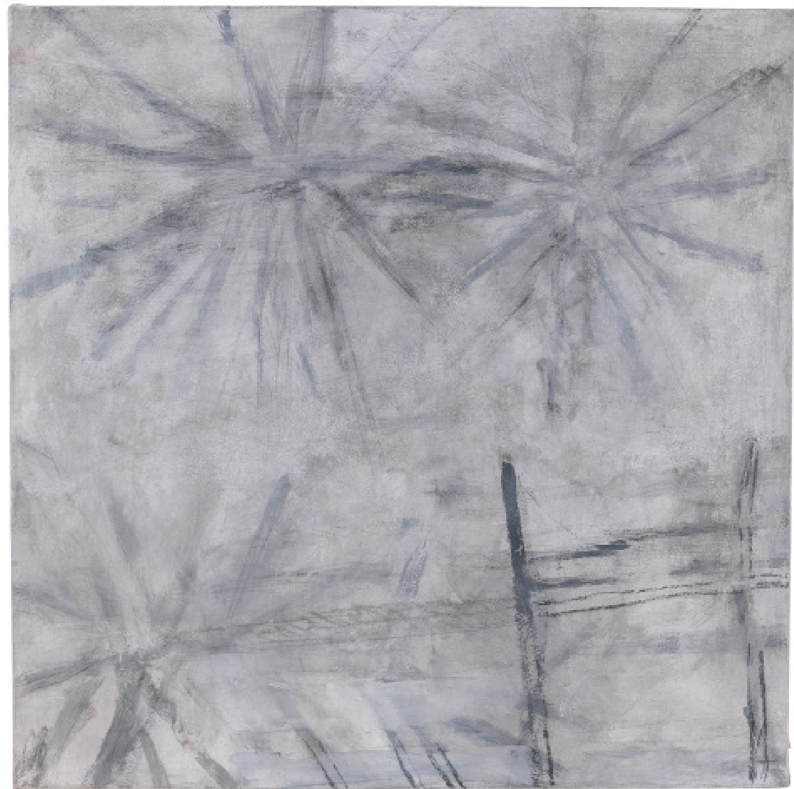
Colette Brunshwig Sans titre, 2000 acrylic on paper mounted on canvas 75 x 75 cm Inv.#CB/P 25