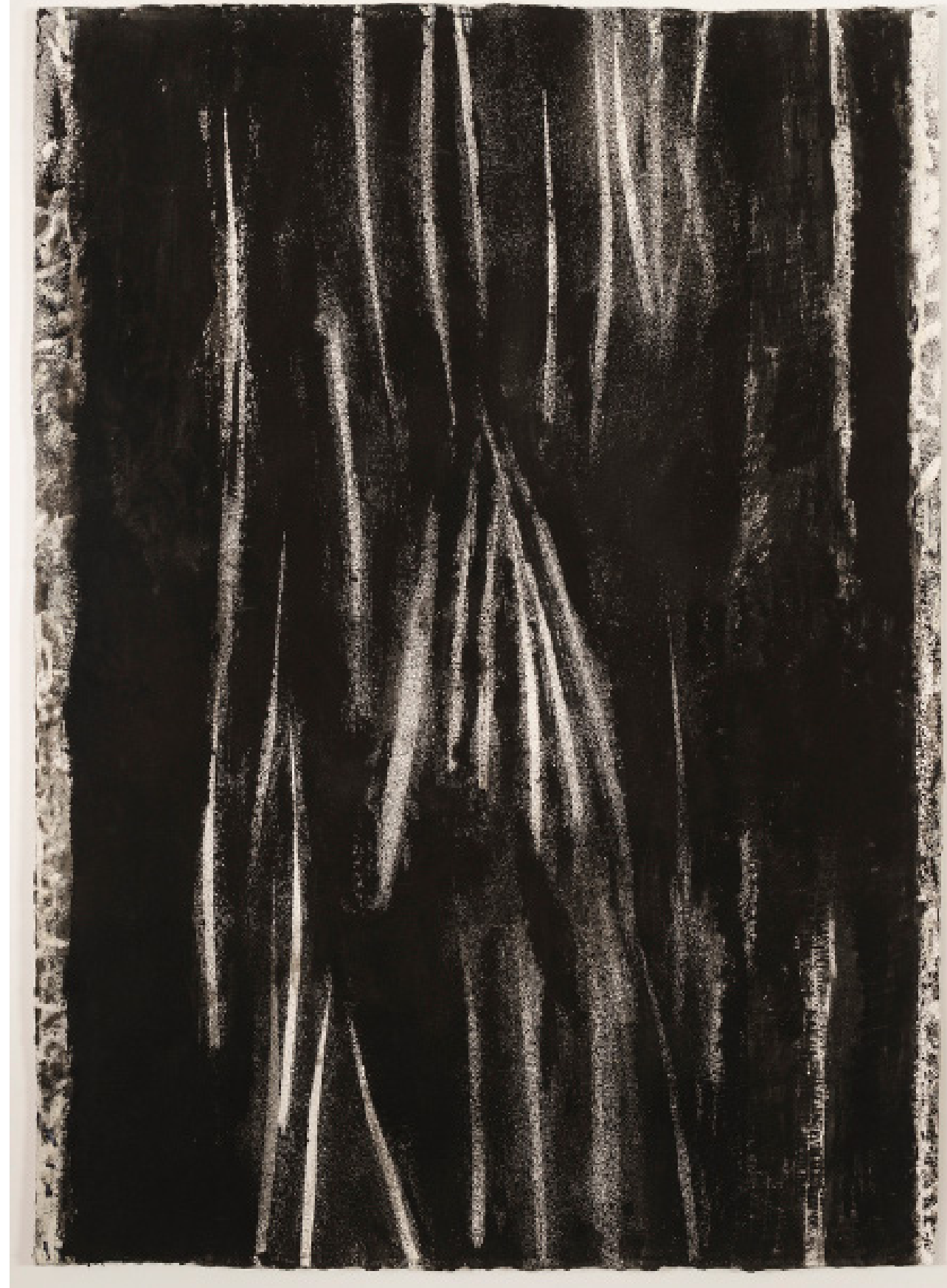
Colette Brunshwig Sans titre, 2015 India ink on paper 106 x 75 cm Inv.#CB/D 11