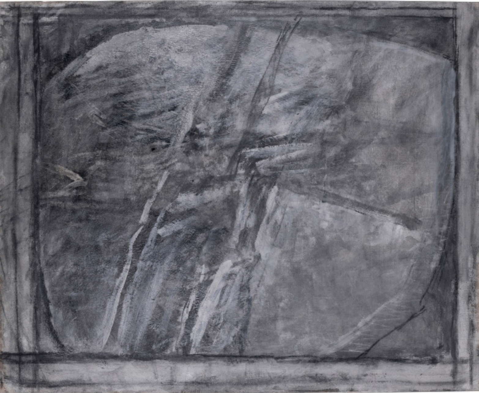
Colette Brunshawig Sans titre, 1970 acrylic on canvas 104 x 84 cm Inv.#CB/P 26