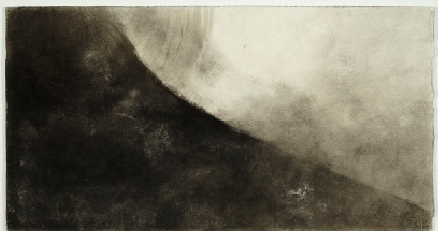
Colette Brunschwig Sans titre, 1981 indian ink on paper 75 x 143 cm Inv.#CB/D 17