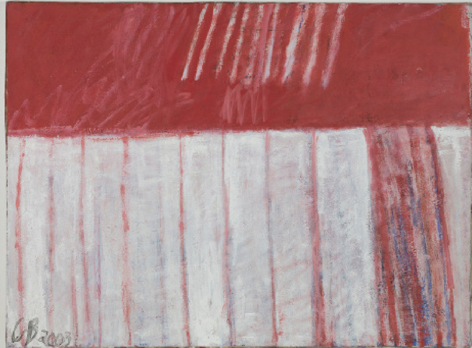
Colette Brunshawig Sans titre, 2003 acrylic on canvas 54 x 75 cm Inv.#CB/P 20