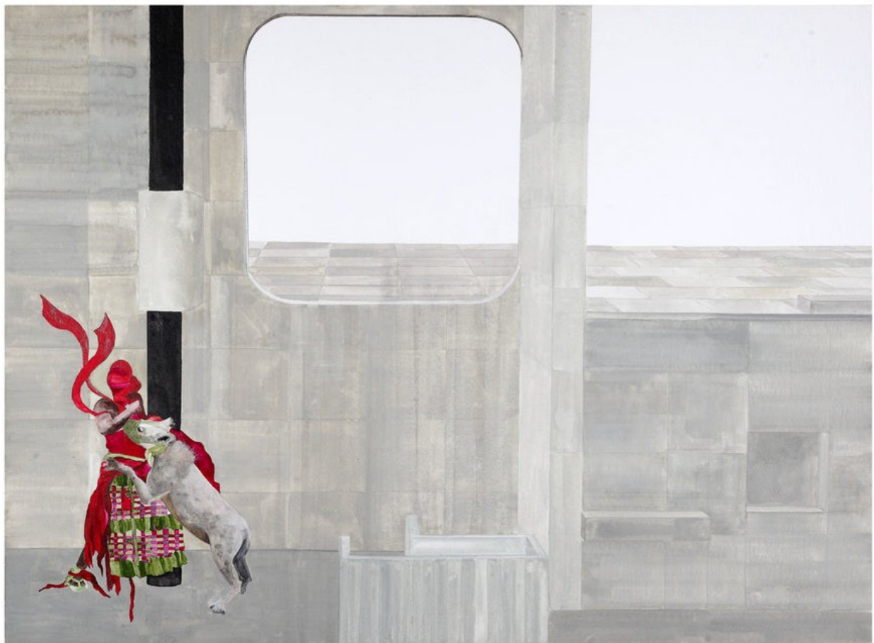
Isa Melsheimer Nr. 274 2011 MEL/D 26 Gouache on paper 42 x 56 cm unique