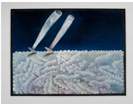
Santiago de Paoli Deux Nuages 2019 oil on felt fabric 46 x 60,5 cm, Inv.# SDeP/P 110