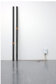
Judith Fegerl moment 2018 two parts, solid steel poles, electromagnets height 175 cm each diameter 50 mm 3 m cable, Inv.# JFEG/S 2