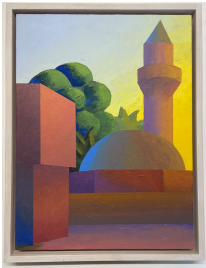
Salvo Senza titolo 1992 oil on cardboard lined on canvas 40 x 30 cm, 43.5 x 33 x 4 cm Inv.# SAL/P 2