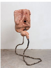
Diego Bianchi Networking 2021 stainless steel, epoxy clay, plastic, wood, rubber 181 x 67 x 130 cm, Inv.# DB/S 148