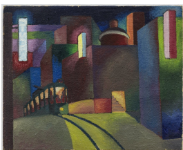
Salvo Senza titolo 1983 oil on canvas 40.5 x 50.5 cm, Inv.# SAL/P 1