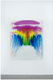
Miriam Cahn atombombe 04.02.1988 watercolor on paper 143 x 1,215 cm, Inv.# CAH/D 1006