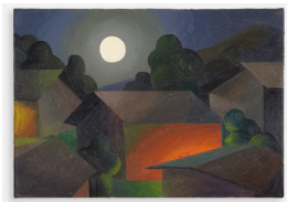
Salvo Alba di luna 2004 oil on canvas 35 x 50 cm, 38 x 53 x 4 cm Inv.# SAL/P 3