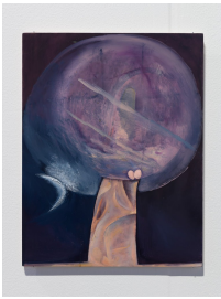
Santiago de Paoli Solo 2020 oil on wood 45 x 35 cm, Inv.# SDeP/P 165