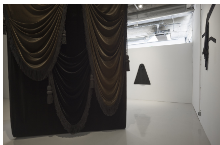
Philippe Schwinger & Frédéric Moser Lincoln's Funeral , 2018 cotton fabric, velveteen, silk velvet passements 300 x 250 x 70 cm, unframed, Inv.# SWI-MOS/S 23