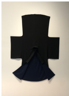
Philippe Schwinger & Frédéric Moser Citizen K , 2018 linen fabric 200.5 x 146 x 9.5 cm, Inv.# SWI-MOS/S 28