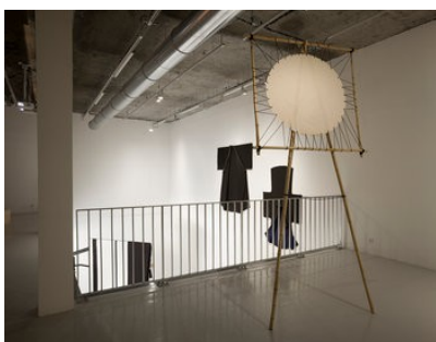
Philippe Schwinger & Frédéric Moser Décentre-moi , 2021 bamboo, cotton fabric and rope 288 x 128 x 136 cm. Inv.# SWI-MOS/S 37