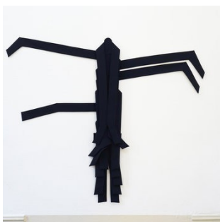
Philippe Schwinger & Frédéric Moser Crazy Old Dream , 2019 wool fabric 130 x 145 cm, Inv.# SWI-MOS/S 26