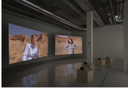
Philippe Schwinger & Frédéric Moser Double Bodies , 2018 synchronized two channel 4K video installation, 16:9, color, sound Inv.# SWI-MOS/I 7