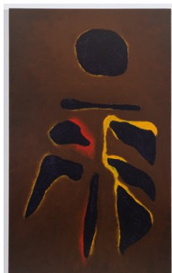
Philippe Schwinger & Frédéric Moser Transfigurine 1 , 2021 oil on canvas mounted on wood 5 elements, each 18.8 x 11.4 x 0.8 cm Inv.# SWI-MOS/P 1