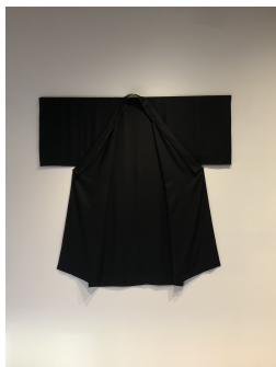
Philippe Schwinger & Frédéric Moser Citizen O. 2018 linen fabric and tussah silk fabric 200 x 202 x 11 cm, Inv.# SWI-MOS/S 27