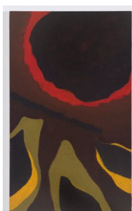
Philippe Schwinger & Frédéric Moser Transfigurine 3 , 2021 oil on canvas mounted on wood 5 elements, each 18.8 x 11.4 x 0.8 cm Inv.# SWI-MOS/P 5