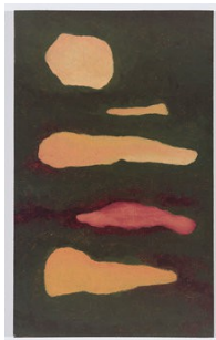
Philippe Schwinger & Frédéric Moser Transfigurine 4 , 2021 oil on canvas mounted on wood 5 elements, each 18.8 x 11.4 x 0.8 cm. Inv.# SWI-MOS/P 6