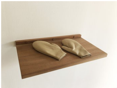
Philippe Schwinger & Frédéric Moser Rosebud , 2021 goat leather, mahogany wood Overall dimension of the work installed (at Galerie Jocelyn Wolff, 2021): H107 x 47 x 27 cm Gloves: H2 x 7 x 22 cm, Inv.# SWI-MOS/S 35