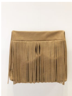
Philippe Schwinger & Frédéric Moser Au dernier jour. 2021 mutton leather 60 x 60 x 15 cm hanging height (from the ground): 160 cm Inv.# SWI-MOS/S 33