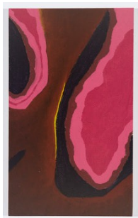
Philippe Schwinger & Frédéric Moser Transfigurine 5 , 2021 oil on canvas mounted on wood 5 elements, each 18.8 x 11.4 x 0.8 cm Inv.# SWI-MOS/P 7