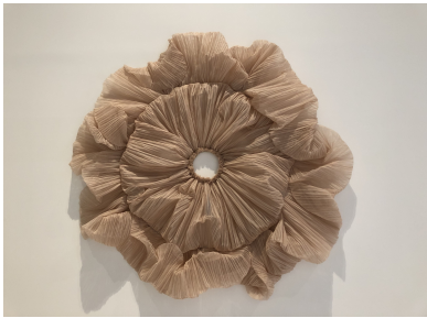
Philippe Schwinger & Frédéric Moser Head first. 2018 pleated silk organza 150 x 150 x 20 cm, Inv.# SWI-MOS/S 30