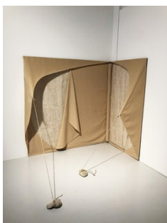
Philippe Schwinger & Frédéric Moser Waiting around the corner , 2021 fabric, wires and stones Overall: H164 x W188 x D140 cm width 1st panel: 163 cm width 2nd panel: 94 cm. Inv.# SWI-MOS/S 36