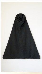
Philippe Schwinger & Frédéric Moser Little Hands , 2020 jeans (fabric) H100 x 78 x 2 cm hanging height (from the ground): 173 cm, Inv.# SWI-MOS/S 34