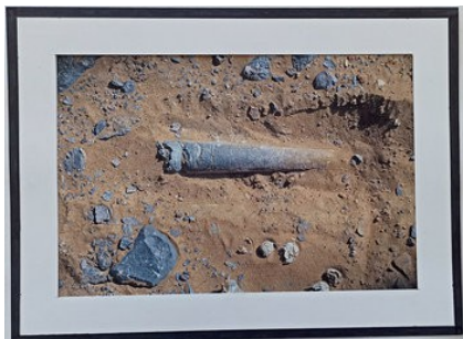
Philippe Schwinger & Frédéric Moser Ajourner l'instant III , 2021 color print on paper 18 x 24 cm, Inv.# SWI-MOS/PH 5