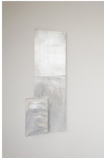
Philippe Schwinger & Frédéric Moser Parade , 2020 silver glitter goat leather 100 x 28 cm, Inv.# SWI-MOS/S 31