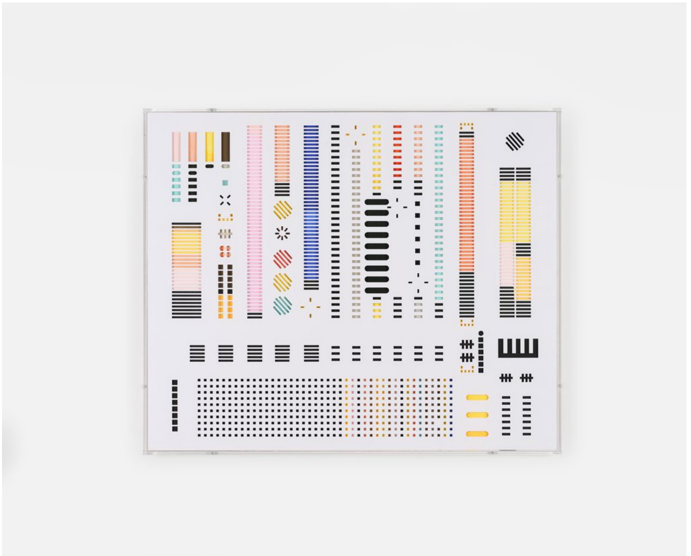
Elodie Seguin Sans titre 2023 paper, paint on paper 49.7 x 60 cm