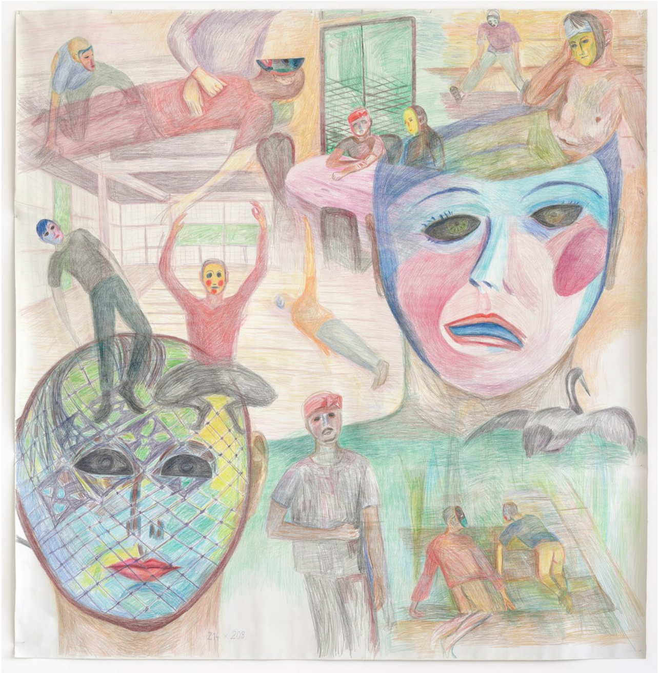
Prinz Gholam There are Eyes 2022 colored pencil on canvas 214 x 208 cm Inv.# PGH/D 31