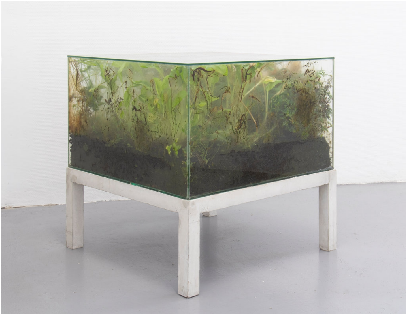
Isa Melsheimer Wardian Case (Fogo Island) 2018 concrete, glass, soil, plants 60 x 60 x 60 cm