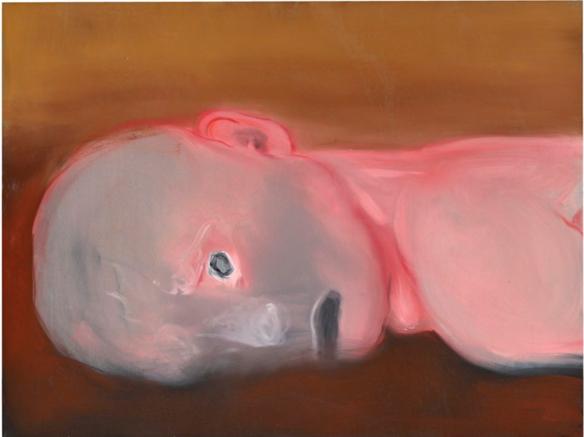
Miriam Cahn MULL, 19.3.24 2024 oil on wood 60 x 80 x 0.5 cm