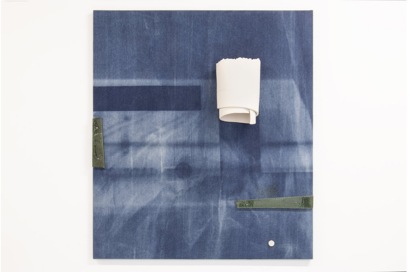
Katinka Bock Constellation anonyme (Genova) 2024 cotton on wood, ceramic, glazed ceramic