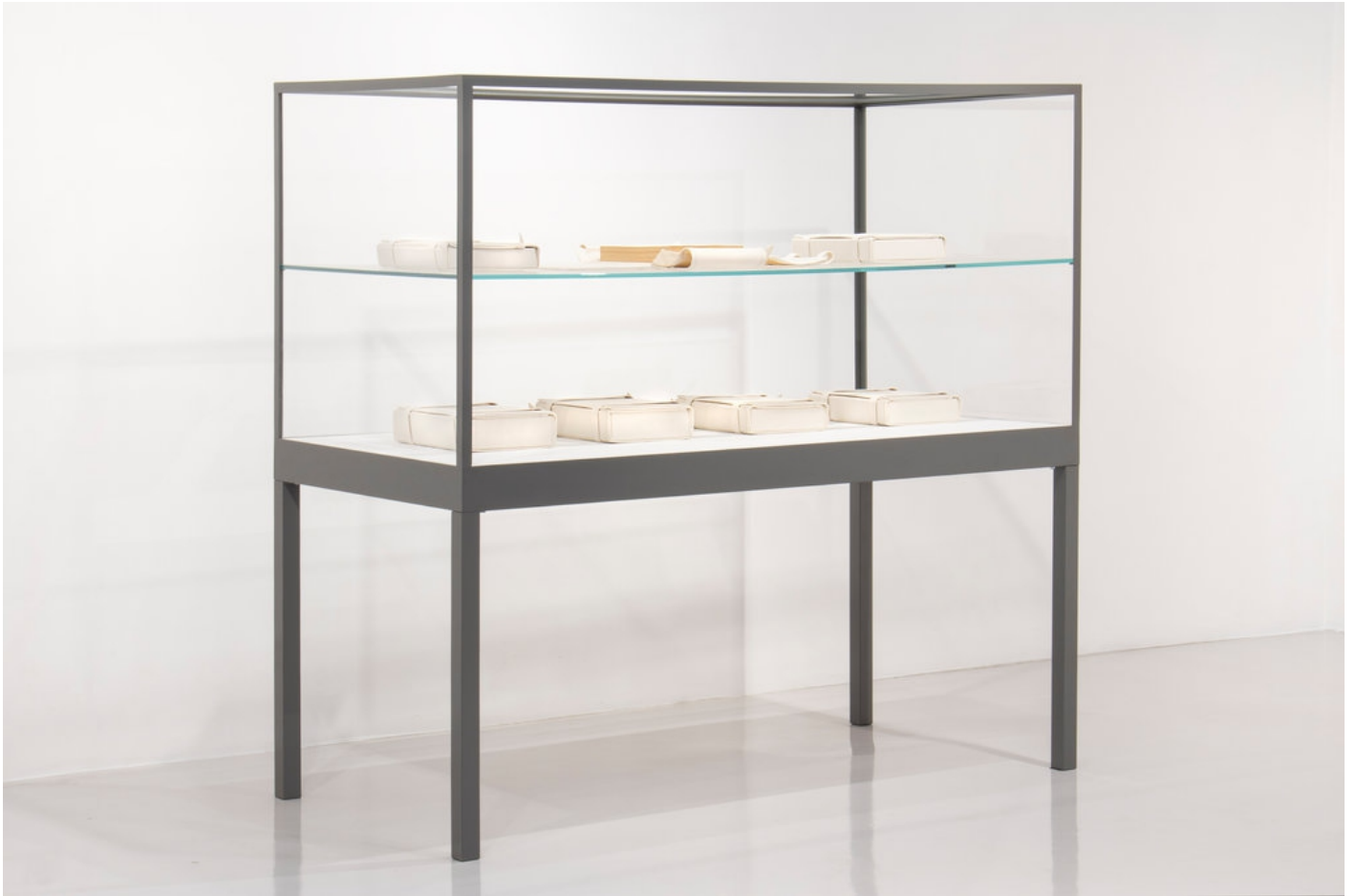
Franz Erhard Walther Sieben Papierblöcke in Kassetten 1962-1963 cotton, paper, plywood approx. 32,3 x 24 x 7 cm each unique FEW/S 251