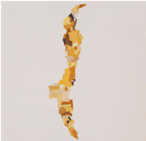
IRENE KOPELMAN, CÁRCAVA A , 2020, OIL ON CANVAS, 20 x 20 CM, UNIQUE, COURTESY OF THE ARTIST AND GALERIE JOCELYN WOLFF