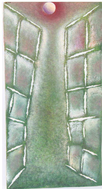
SANTIAGO DE PAOLI, CHESSE MOON , 2023, OIL ON WOOD, 35,5 x 18 CM, UNIQUE, COURTESY OF THE ARTIST AND GALERIE JOCELYN WOLFF