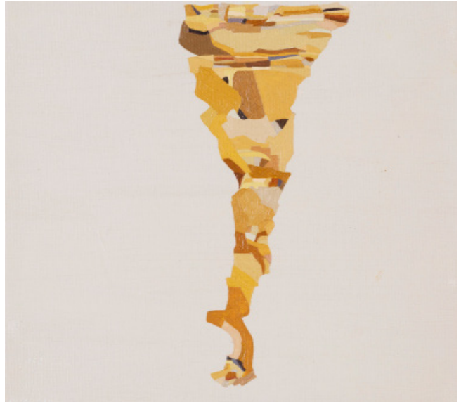
IRENE KOPELMAN, CÁRCAVA C , 2020, OIL ON CANVAS, 20 x 20 CM, UNIQUE, COURTESY OF THE ARTIST AND GALERIE JOCELYN WOLFF