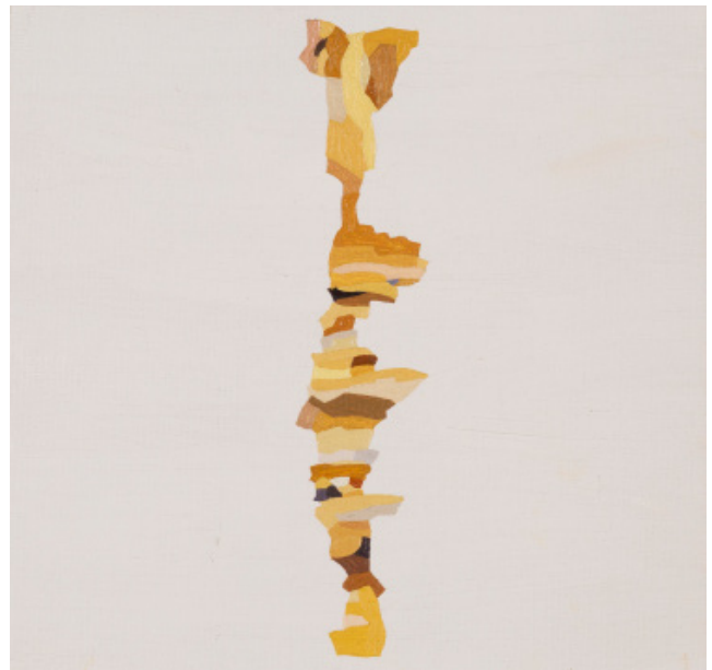
IRENE KOPELMAN, CÁRCAVA I , 2020, OIL ON CANVAS, 20 x 20 CM, UNIQUE, COURTESY OF THE ARTIST AND GALERIE JOCELYN WOLFF