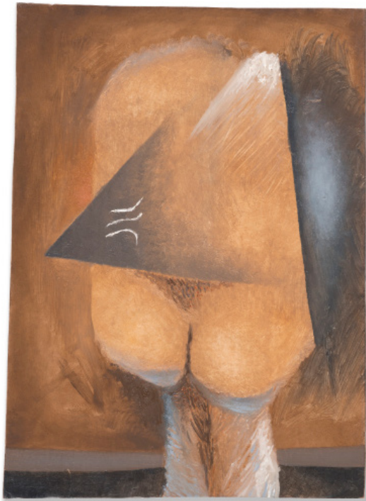
SANTIAGO DE PAOLI, SOLO , 2021, OIL ON FELT FABRIC, 38,5 x 28 CM, UNIQUE, COURTESY OF THE ARTIST AND GALERIE JOCELYN WOLFF