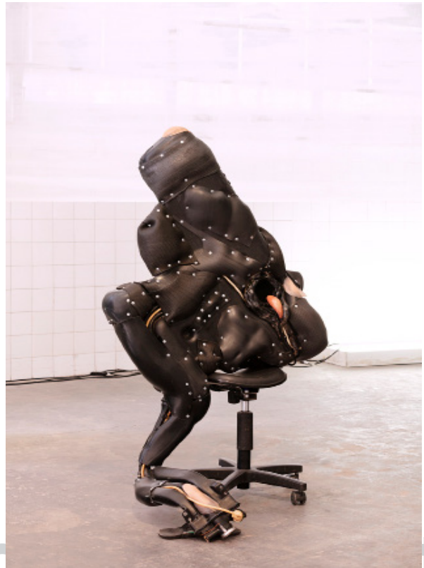
EXHIBITION VIEWS, CORPO-GASA: DIÁLOGOS ENTRE CAROLEE SCHNEEMANN, DIEGO BIANCHI E MÁRCIA FALCÃO , PIVÔ ART AND RESEARCH, SÃO PAULO, 6 APRIL - 7 JULY 2024, PHOTOS BY EVERTON BALLARDIN