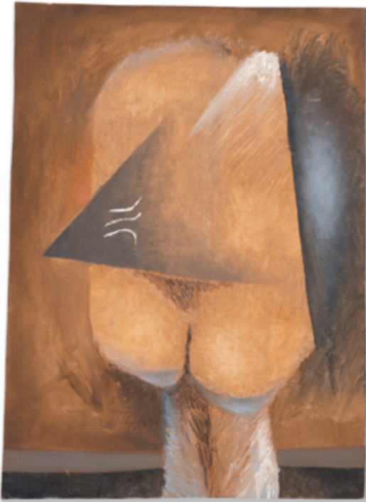
SANTIAGO DE PAOLI, SOLO , 2021, OIL ON FELT FABRIC, 38,5 x 28 CM, UNIQUE, COURTESY OF THE ARTIST AND GALERIE JOCELYN WOLFF