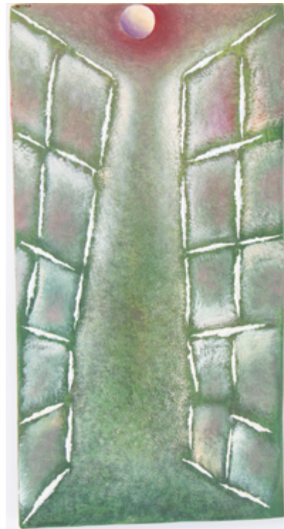
SANTIAGO DE PAOLI, CHESSE MOON , 2023, OIL ON WOOD, 35,5 x 18 CM, UNIQUE, COURTESY OF THE ARTIST AND GALERIE JOCELYN WOLFF