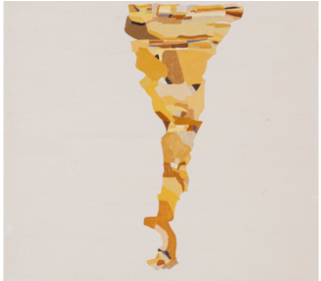
IRENE KOPELMAN, CÁRCAVA C , 2020, OIL ON CANVAS, 20 x 20 CM, UNIQUE, COURTESY OF THE ARTIST AND GALERIE JOCELYN WOLFF