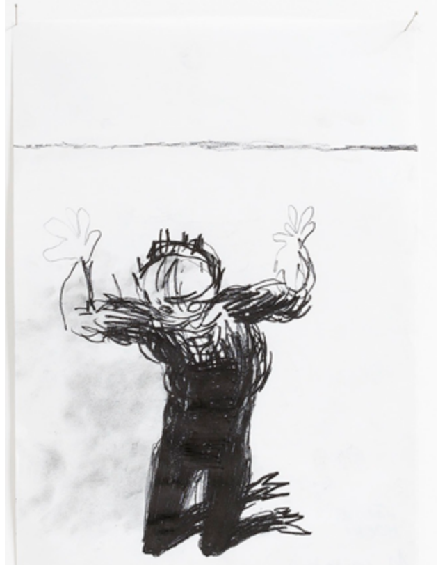
MIRIAM CAHN, HAENDE HOCH! , 12.11.08, GRAPHITE ON PAPER, 30 x 21 CM, UNIQUE, COURTESY OF THE ARTIST AND GALERIE JOCELYN WOLFF